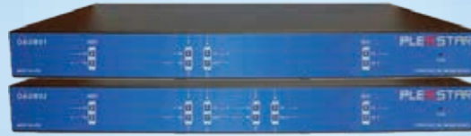
OPTICAL ADD/DROP MUX FOR LAMBDA DROP